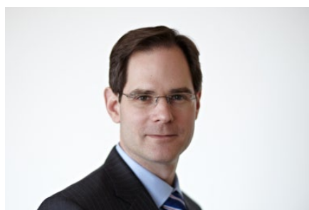
Fund Management: The Invesco Global Asset Allocation Team 3