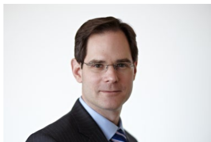
Fund Management: The Invesco Global Asset Allocation Team 3