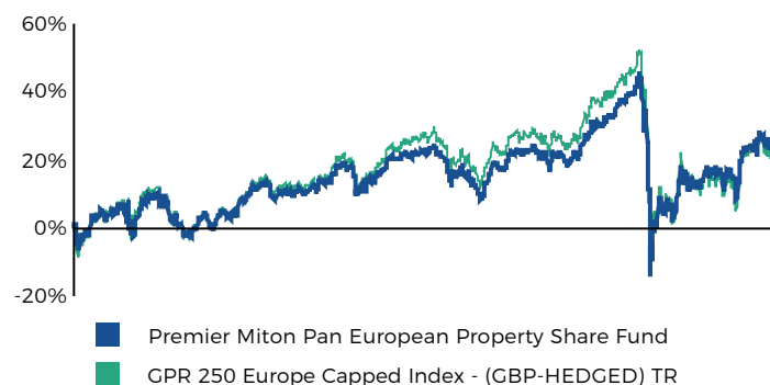
5 year performance chart 31.01.2016 - 31.01.2021

Past performance is not a guide to future returns. The price of shares and income from them can go down as well as up and you may not receive full return of your capital. Source: FE Analytics. Based on a total return, UK Sterling basis. On 20 January 2020, this fund moved from a single pricing basis (mid) to a swing pricing basis, which is where the price can swing to either a bid or an offer basis depending on the investment and redemption activity in the fund. This means the investor selling or buying fund shares bears the associated [dis]investment costs and protects the continuing holders in the fund. Performance could be shown on a combination of bid, mid or offer prices, depending on the period of reporting.