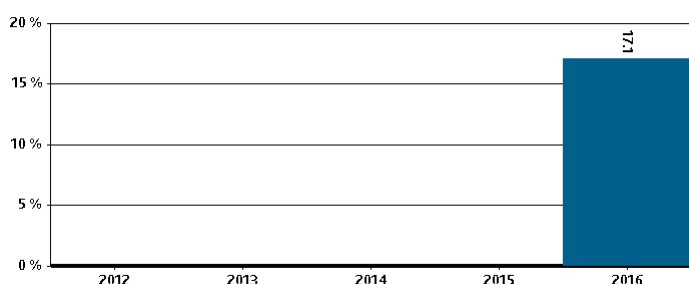
CF Prudential Dynamic Focused 60-100 Portfolio