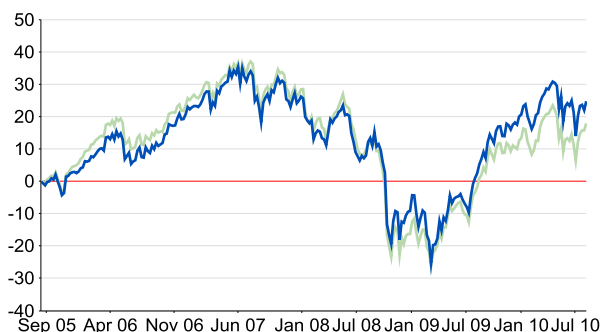
Percentage Change Total Return, Tax UK Net, Charges Applied , In GBP

— Aviva Investors UK Income & Growth Fund — IMA UK All Companies