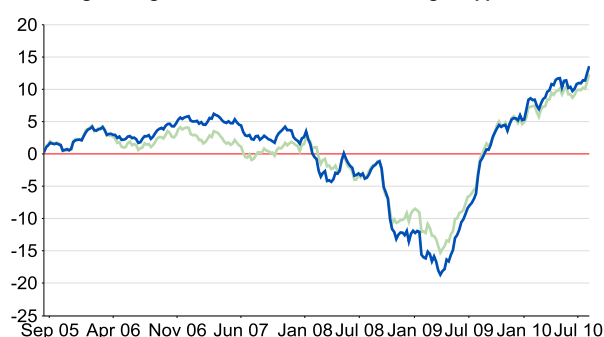
Percentage Change Total Return, Tax UK Net, Charges Applied, In GBP

— Aviva Investors Sustainable Future Corporate Bond Fund — IMA £ Corporate Bond