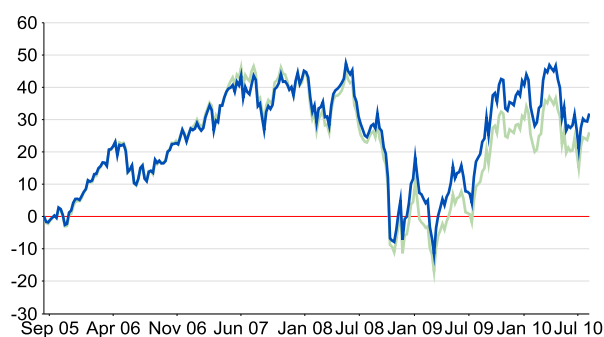
Percentage Change Total Return, Tax UK Net, Charges Applied, In GBP

— Aviva Investors European Equity Fund — IMA Europe Excluding UK