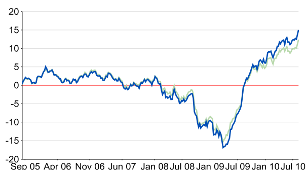
Percentage Change Total Return, Tax UK Net, Charges Applied, In GBP

— Aviva Investors Corporate Bond Fund — IMA £ Corporate Bond