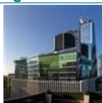
Name: M&G Cash and Currency