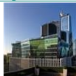
Name: M&G Cash and Currency