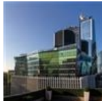
Name: M&G Cash and Currency