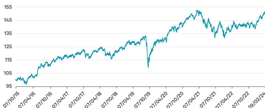
Table 1: Performance (Net of Fees) 5