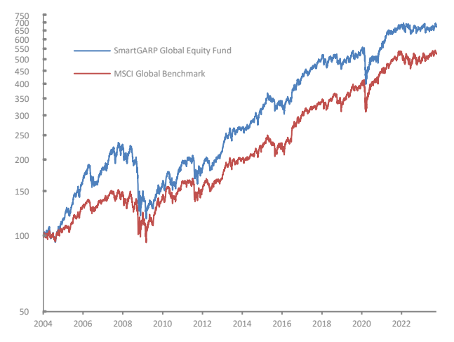
Chart 1: Artemis SmartGARP Global Equity Fund's performance vs. benchmark

fund returns are net of fees (I share class), both series are shown on a logarithmic scale.