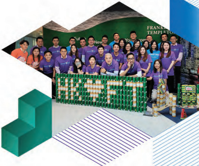
Hong Kong Impact Days 2023

The health of our planet and the well-being of future generations depend on our actions today to preserve our environment and its natural resources. We are reducing our corporate footprint and encouraging environmentally responsible behavior throughout our operations. As we have since 2008, we once again completed climate disclosure through CDP (formerly the Carbon Disclosure Project) and maintained a score of B for fiscal year 2022 (the most recent publicly disclosed information)—above average for companies reporting in North America and globally. Additionally, we secured third-party verification of our greenhouse gas inventory for scope 1, scope 2 and select categories of scope 3.