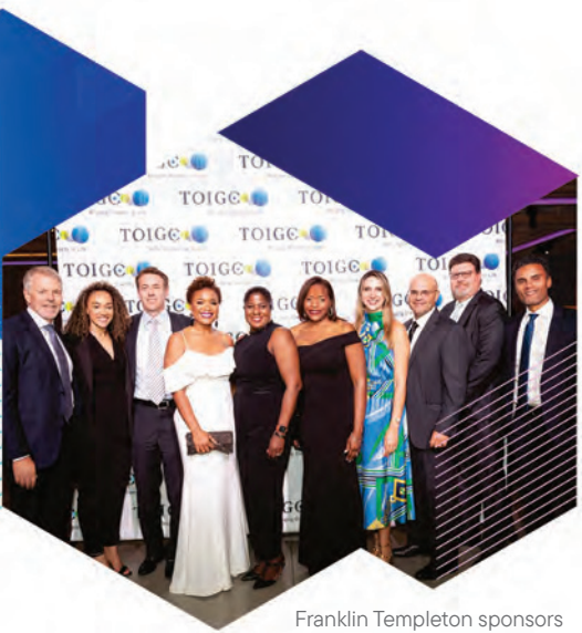
Franklin Templeton sponsors Robert Toigo Foundation event

Our commitment to diversity, equity and inclusion (DE&I) is more than just the right thing to do. It's also a business opportunity, because an inclusive culture helps us to better meet our clients' goals. Through this important work, we aspire to be an employer of choice, business partner of choice and industry of choice for all top talent and our many stakeholders. We are proud to have received in 2023 a top score of 100 in the Disability Equality Index® in the U.S. In the U.K., we also received Stonewall's LGBTQ Inclusive Employer Award and, in the Asia-Pacific region, "Highly Commended" status from 100 Women in Finance. We have also forged strategic partnerships to influence macro change across our industry, including with the Diversity Project Europe, Equity Collective, Financial Alliance for Racial Equity and the Robert Toigo Foundation.