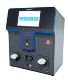
ExPERT VLx: Designed for very large volume cell-engineering

The ExPERT VLx Large-Scale Transfection System is a cGMP compliant instrument specifically designed for very large volume cell-engineering. Using proprietary Flow Electroporation technology, the VLx supports the ability to transfect up to 200 billion cells in less than 30 minutes —10 times the capacity of the STx and GTx. This system is designed for the rapid and large-scale production of recombinant proteins, monoclonal antibodies, viral vectors, vaccines, VLPs and allogeneic cell therapies. We launched the VLx under the ExPERT brand in September 2022 to provide customers with an easy to use, large-scale system that incorporates the benefits of the ExPERT platform for large-scale bioprocessing. As of September 2023, the VLx has an established regulatory path supported by our FDA Master File.