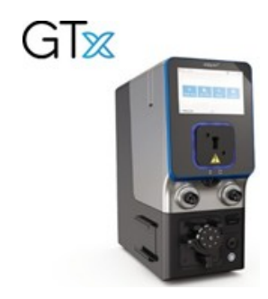
ExPERT GTx: Flow Electroporation for large scale transfection in therapeutic applications

The ExPERT GTx incorporates our proprietary Flow Electroporation technology for use in the cGMP manufacturing of cellular therapies with clinical uses. By incorporating the Flow Electroporation technology, larger volumes of up to 20 billion cells can be electroporated within 15 to 20 minutes. With a processing potential that ranges from 75,000 to 20 billion cells on a cGMP, 21 CFR Part 11 compatible system, the GTx represents a platform for clinical electroporation at large scale.