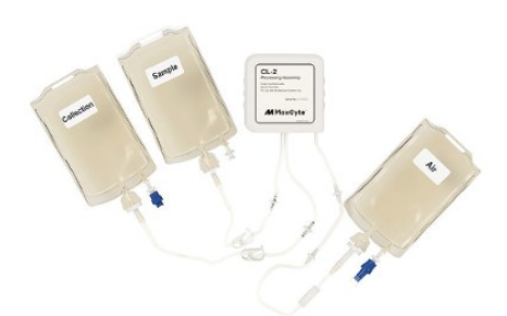
ExPERT Flow Electroporation design (Flow Processing Assembly)

We have conducted extensive end-user research to continue improving the design of the PAs and the range of products available. We launched the ExPERT cuvette in 2020 based on customer feedback, which incorporated a new design to improve handling and ease of use, and we have continued to expand the availability of the ExPERT PA portfolio design. We have also expanded our portfolio of multi-well cuvettes, which reduce manual handling and improve productivity in the lab, with the launch of our R-50x8. The R-50x8 is an 8-well cuvette capable of processing up to 225,000 cells in each well. By enabling eight samples to be processed in the same cuvette, a more efficient process can be achieved by users. We plan to continue to support customers using legacy processing assemblies until they transition to our ExPERT products.