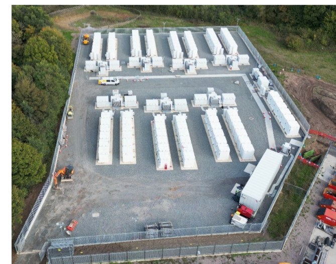
Enderby (57 MW / 57 MWh)