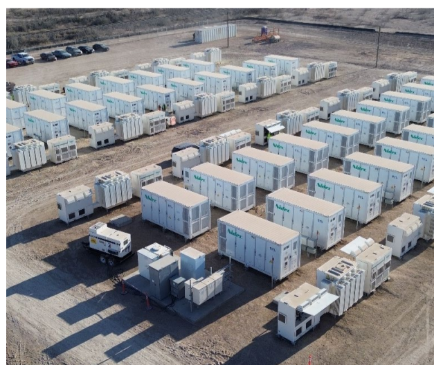
Dogfish (75 MW / 75 MWh)

Dogfish (75 MW / 75 MWh, Texas) and Enderby (57 MW / 57 MWh, Great Britain) were energised in February. Dogfish is the Company's third largest energised asset to date. The energisation of these assets is a key milestone for the Company and brings its total energised capacity to 753.4 MW / 924.1 MWh. This significant milestone represents a 79% increase in MW capacity, including the energisation of the "Big Rock" asset in California, US (200 MW / 400 MWh) announced in January. All assets are scheduled to be revenue-generating in FYQ1 (by June-end) of the upcoming Financial Year (FY25/26).