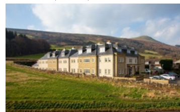
Lombard View, Falkland, Fife.