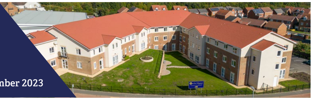
Merlin Manor Care Centre, Hartlepool, County Durham.