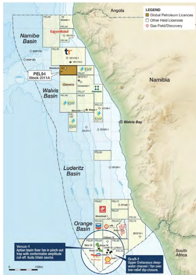
FIGURE 1 - Map of Namibia showing PEL0094