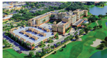
FREEDOM POINTE AT THE VILLAGES THE VILLAGES, FL

Offers seniors an active lifestyle, peace of mind, security, and continuum of care in a highly amenitized campus setting