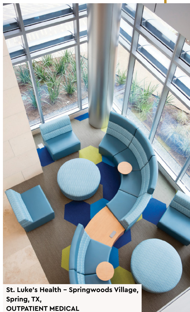
St. Luke's Health – Springwoods Village, Spring, TX, OUTPATIENT MEDICAL

Our CCRC business produced record results in 2024, driven by occupancy growth and rate growth, as consumers appreciate the value proposition of our highly amenitized properties. The business is currently in an upcycle that is benefiting our earnings growth.