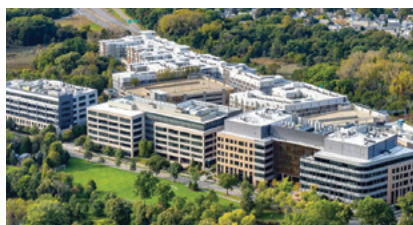
CAMBRIDGE DISCOVERY PARK CAMBRIDGE, MA

New and innovative drugs, therapeutics, and medical devices are developed in our lab properties