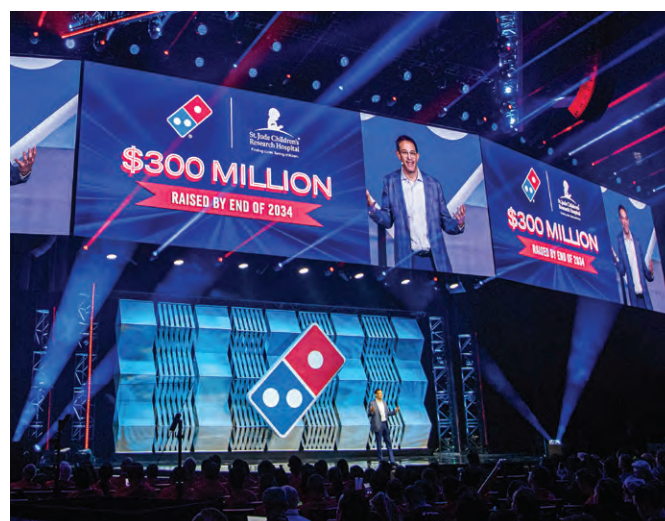
Domino's committed to raising $300 million for St. Jude Children's Research Hospital, the largest commitment to a children's hospital ever made.

In the U.S., St. Jude Children's Research Hospital™ is our national charity partner, and for 20 years we have supported this lifesaving organization, raising over $143 million in customer donations since 2004, and joining them in their mission to find cures and save children around the world. At Rally this year, I announced Domino's commitment to raising $300 million for St. Jude by 2034 . No brand has ever made a commitment like this to a children's hospital, and I am proud to say that in 2024 we raised $18 million, already exceeding our annual target on the road to a cumulative $300 million.