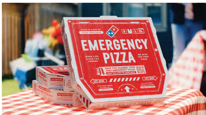
Emergency Pizza was back in 2024 in more places than ever.

We leaned into consumer tensions and created talk value in our national promotions. At a time where consumers are feeling they are getting less and paying more – our MORE-flation campaign showed them Domino's was in their corner – giving them more for less. Another area where we broke through the clutter in 2024 was around the growing pressure to tip, even when no extra service is provided. We decided to flip the script by tipping customers back through our You Tip, We Tip promotion. Finally, we brought our Emergency Pizza campaign back, but in more places than ever. We partnered with Amazon's Twitch, Netflix's Squid Games, NFL star Stefon Diggs, and the beauty brand Olive & June to bring Emergency Pizza to consumers in fun and unexpected ways.