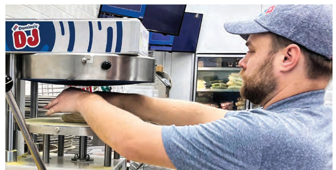
Domino's 'DJ' dough stretching machines are having an impact on product consistency and speed to competency for new team members.

Additionally, we also made significant progress in deploying 1,600 'DJ' dough stretchers (appropriately named DJ, for the way it 'spins' dough) across our U.S. system – more than a 50% increase from where we were at the end of Q3. All these investments ensure that every Domino's customer receives a consistent, high-quality experience. They also make the job easier for current team members and speed up the time to competency for new employees. I want to thank our franchisees and our operations team for their continued efforts to achieve Operational Excellence. This is a point of pride and differentiation for Domino's.