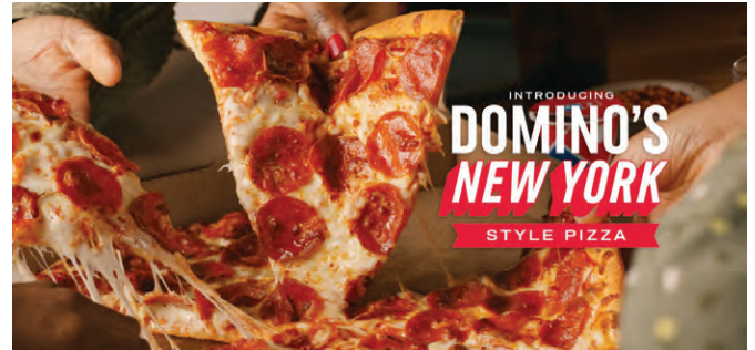
Domino's launched New York Style Pizza, reflecting our commitment to having the Most Delicious Food.

New York Style Pizza added a popular crust option to our menu, while Mac & Cheese reinvigorated our existing pasta platform. As we head into 2025, we will continue to build on this momentum by focusing on making our innovation more ownable and memorable through the launch of at least two new products – which is our annual goal.