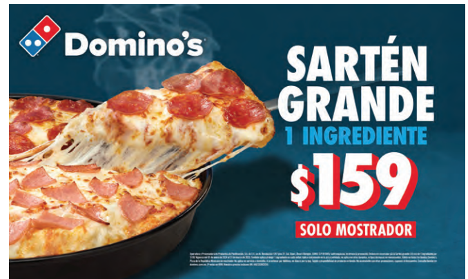
Mexico and our other international markets successfully leaned into Renowned Value in their promotions.

Despite geopolitical challenges and economic pressures, our international franchisees have shown remarkable resilience and have enormous potential for growth. By focusing on driving our Hungry for MORE strategy, we expect to create sales momentum that will produce the same kind of market share gains and net store growth we have achieved in the past.