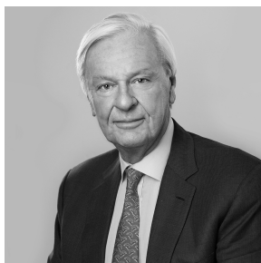
John Sievwright Chair