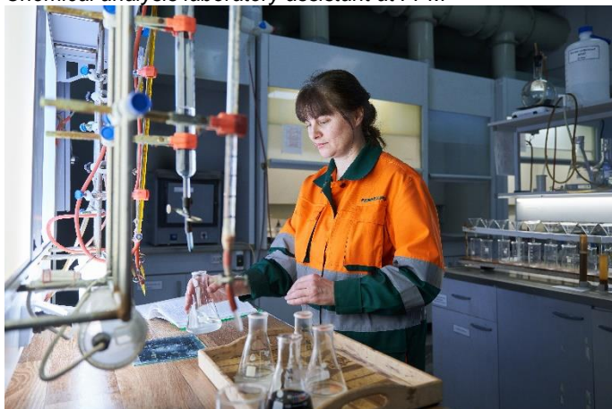
Chemical analysis laboratory assistant at FPM