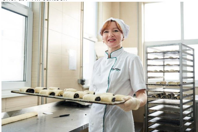
Chef at FYM canteen