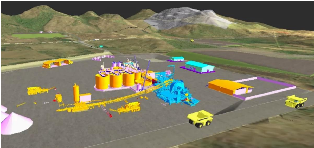
Figure 1: View of Planned 2800 TPD Plant

The Hanlon deliverables included over 100 drawings covering Civil, Electrical, Process flow diagrams and general arrangements, along with the reports detailing the capital cost sections of the FS and the operating costs for the plant area.