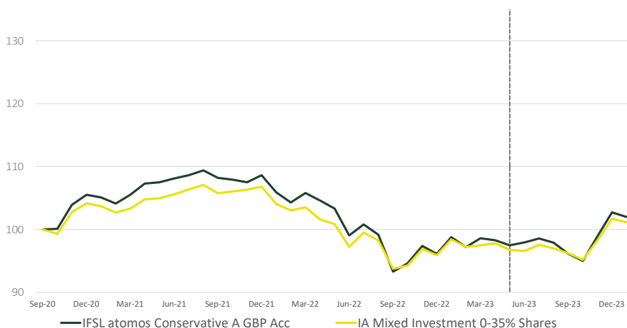
Performance of the fund since launch (%)

Past performance is not a reliable indicator of future performance. The value of investments, and any income from them, can go down as well as up and is not guaranteed. You may get back less than you originally invested.