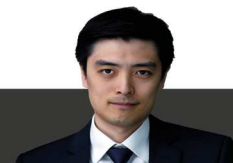
Hong Yi Chen

C Acc GBP Class - Fund Factsheet - Covering the month of March 2024