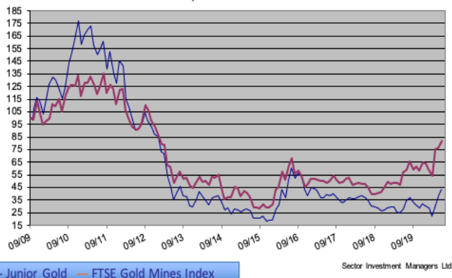
Junior Gold vs. FTSE Gold Mines Index 8 Sep 2009 to 30 June 2020