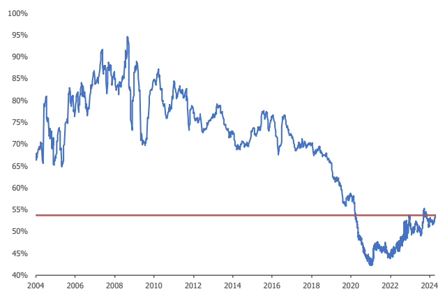
Chart 2: Relative price-earnings ratio of SmartGARP Global Equity Fund vs. Market

Last, but not least, the fund's tilt towards value stocks, that is stocks trading on below market valuations, remains very pronounced. At the end of March 2024, the fund was trading on an average price-earnings ratio of 9.4 versus the benchmark at 17.6. This 47% discount to the market remains very low in the context of the 21 years one of the present managers has managed the fund (see Chart 2).