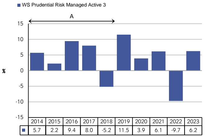
A: The fund's investment policy changed in January 2019 and therefore past performance before that date was achieved under circumstances which no longer apply