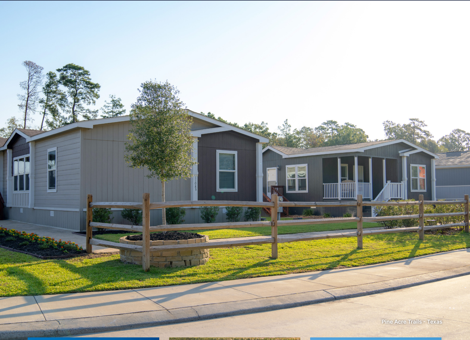
Pine Acre Trails - Texas