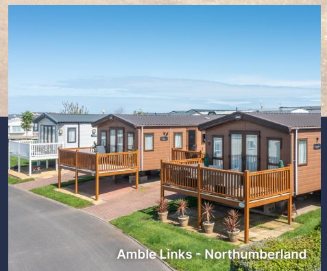
Amble Links - Northumberland