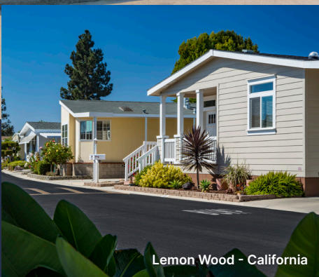
Lemon Wood - California