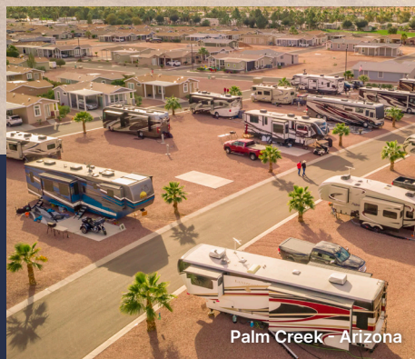
Palm Creek - Arizona