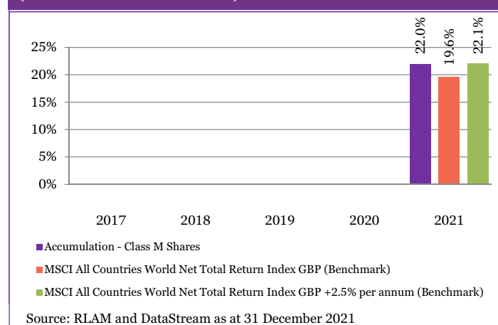
The Royal London Global Sustainable Equity Fund (Accumulation - Class M Shares) in GBP

Past performance is not a guide to future performance and may not be repeated.